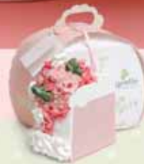
→ Princess Cake (8 slices) C300

Fairytales and little girls dreams inspired this cute as a button range. Princess by name and subtle by nature these cakes have been designed in keeping with modern shabby chic styling for the princess in all of us.