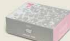
→ Baby Girl Soap BSG014 - 160g