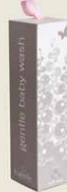
→ Baby Wash Girl BWG014 - 250ml