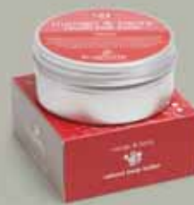
→ Mango & Berry Body Butter BBM001 - 180ml