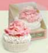
→ Princess Pink Cup Cake CCP006