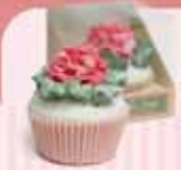
→ Flower Pink Cup Cake CCF006