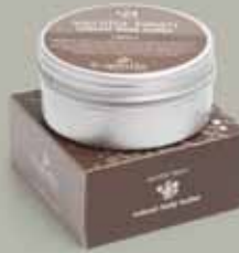
→ Vanilla Bean Body Butter BBV001 - 180ml