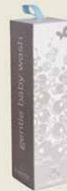
→ Baby Wash Boy BWB014 - 250ml