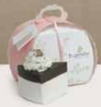
→ Chocolate Cake [8 slices] C600