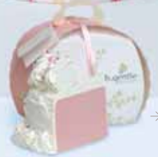
→ Icecream Cake (8 slices) C500