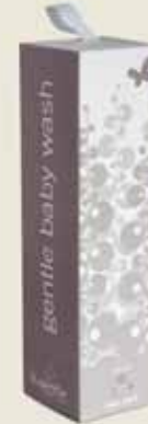
→ Baby Wash Unisex BWU014 - 250ml