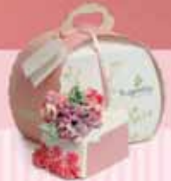
→ Flower Cake (8 slices) C200

Inspired by the traditional English rose garden this enchanting cup cake and cake range is the matriarch of B.Gentle's history. The Flower range is a real keeper. Sophistication and classic beauty is this old girls secret.