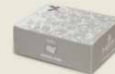
→ Baby Unisex Soap BSU014 - 160g