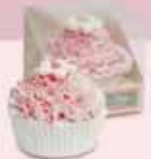
→ Candy Pink Cup Cake CCC006