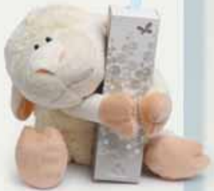
→ Baby Boy Cuddle Pack BCB014