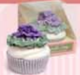
→ Flower Purple Cup Cake CCF002