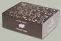
→ Vanilla Bean Soap BVB012 - 165g