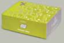
→ Melon Body Soap BWM012 - 165g