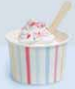
→ Ice Cream Cup ICE006