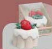
→ Christmas Pudding CPX004