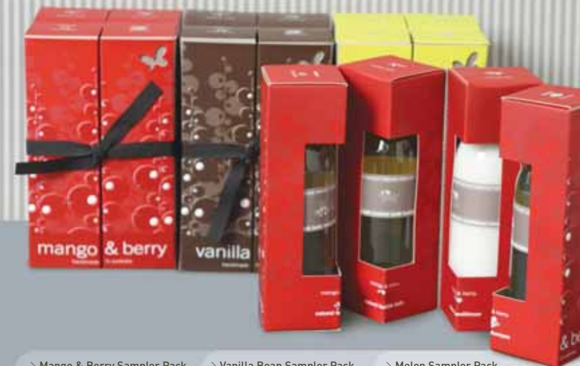
→ Mango & Berry Sampler Pack GPM001 - 125ml x 4 bottles

• Shampoo • Baby Wash • Moisturiser • Massage Oil