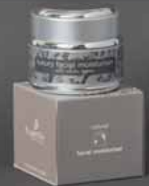
→ Luxury Facial Moisturiser FC001 - 50g