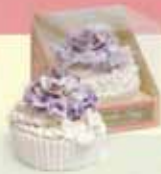
→ Princess Purple Cup Cake CCP002