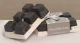
→ Block of Chocolate CB001