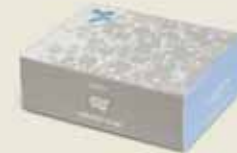
→ Baby Boy Soap BSB014 - 160g