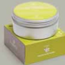
→ Melon Body Butter BBW001 - 180ml