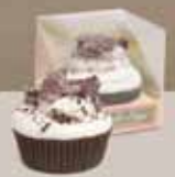
→ Chocolate Cup Cake CCH004

Irresistible and mouth wateringly delicious, these cakes have been whipped, baked and iced with the die hard chocoholic in mind. If this happens to be sending your taste buds wild please be assured that you should not taste test.