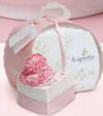
→ Candy Cake (8 slices) C100