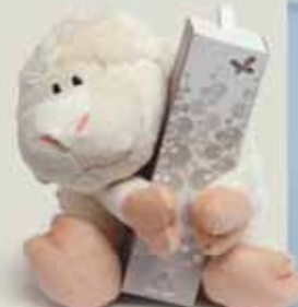
→ Baby Unisex Cuddle Pack BCU014