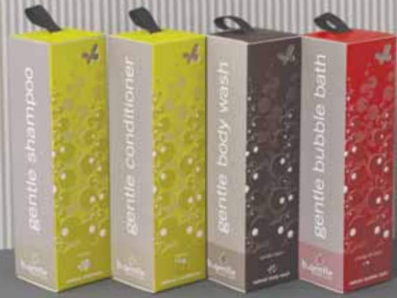
→ Melon Shampoo SPS001 - 250ml