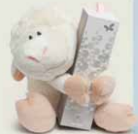
→ Baby Girl Cuddle Pack BCG014